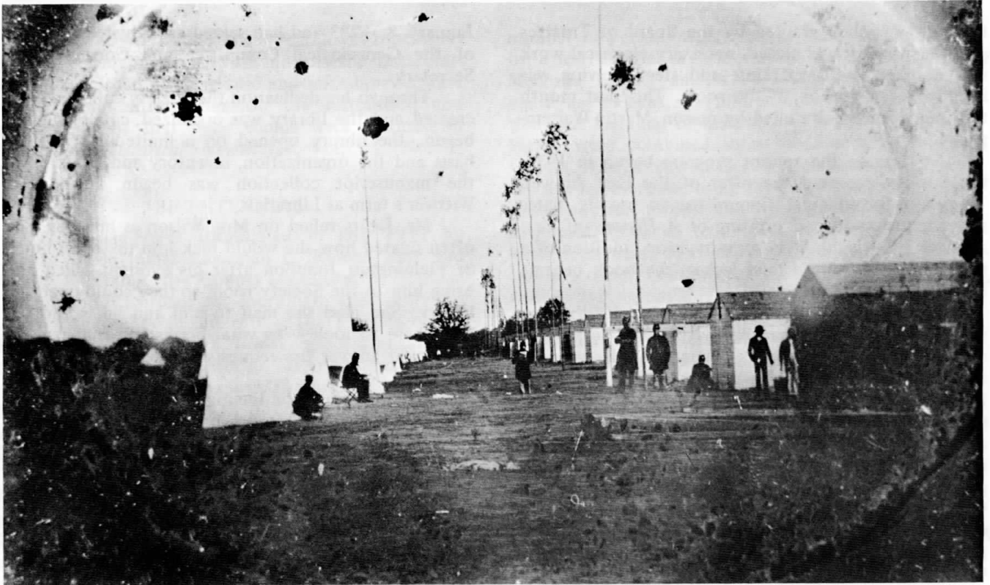
This view of New Jersey Civil War Rendezvous No. 3 also known as Camp Vredenburg at Freehold, N.J. is taken from a remarkable ambrotype in the collection of the Monmouth County Historical Association . Since all buildings at all the new camps were built under a common state contract, those at Flemington would be very similar to these.