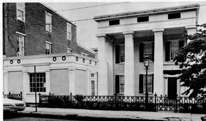
The Doric House and one-story wing after the second phase of restoration was completed.