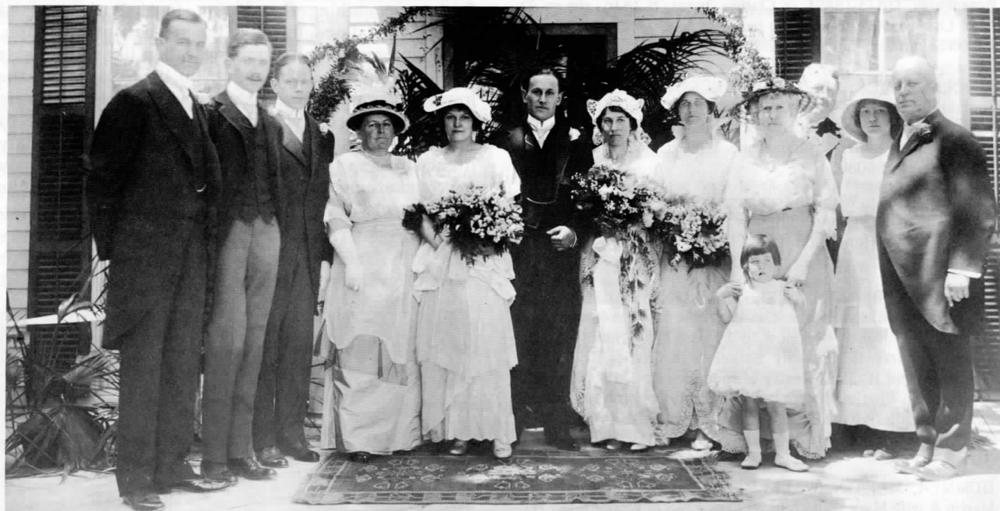
Wedding at "Uplands" June 17, 1914

Excess of Expenses over Income $ 4,841.13