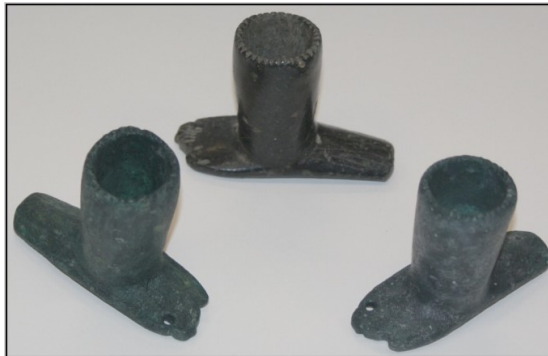
Tuccamirgan's peace pipe (top) and its two 3D replicas made with a 3D printer.

Johnson scanned the pipe four times, turning it gently in between each scan. The process took about an hour to generate the data, which was fed into Geomagic DesignX 3D software and massaged in post-processing stages. It needed about an hour to generate the final file needed for