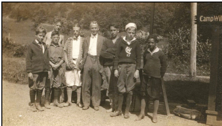
A group gathered for this Camp Wilson photo around 1925.