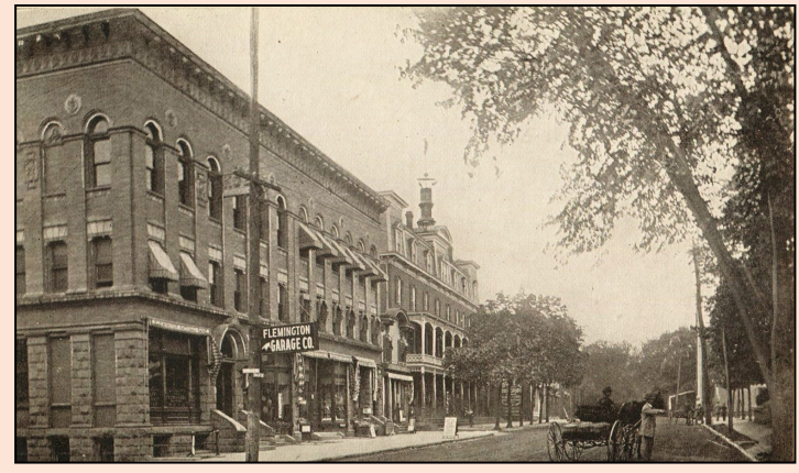
continued next page