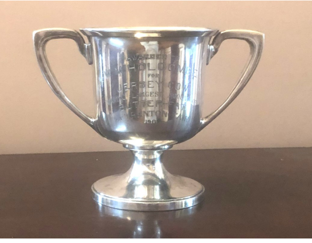
And The Award Goes To-Most Butter Fat!

bits. New sanitary, well-lighted, ventilated concrete animal sheds replaced the old wooden ones at a cost of over $15,000. The cattle show was confined to