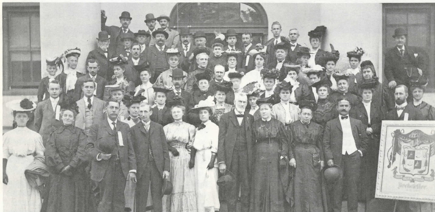
Members of the Rockefeller Family Association met in Hunterdon County October 4, 1906 and posed on the steps of the Courthouse for this photograph.