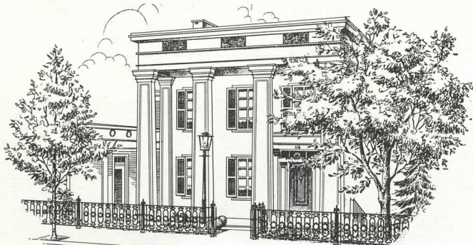
The Doric House, Society headquarters.