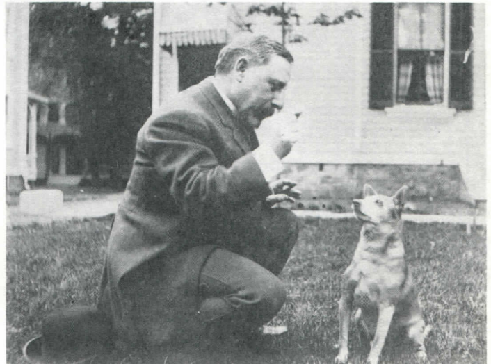
Titus family album