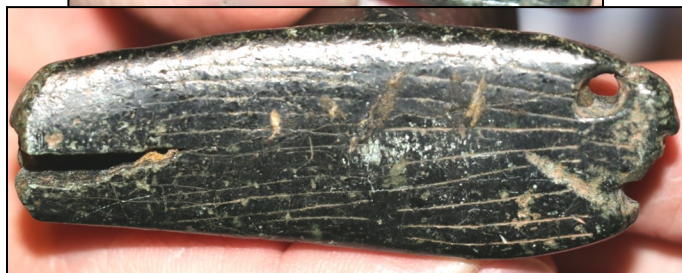
The Tuccamirgan pipe , believed to date around A.D. 410-1180, is a Monitor or platform pipe. Top: Three-inch high pipe bowl. Bottom: Three-inch long pipe base.

from soapstone or, more formally, steatite. These types of pipes are generally believed to date from the Middle Woodland period, roughly A.D. 410-1180.