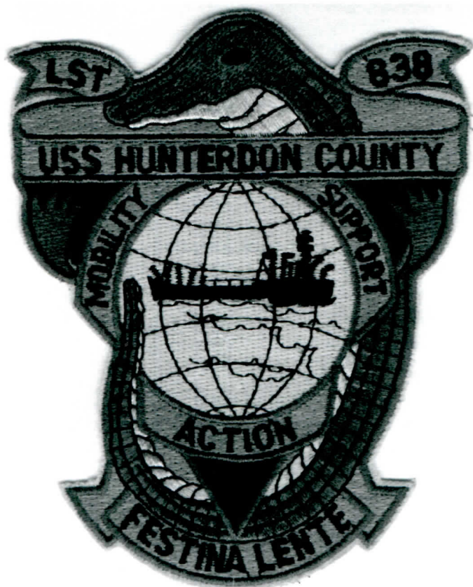
The USS Hunterdon emblem, original in HCHS Collection.

The ship's US Navy career ended on 1 July 1971 when she was leased to Malaysia, at which point deck logs were no longer kept and she disappears into the fog of history. She was finally sold outright to that country in 1974 and permanently stricken from the Navy list. Curators at the Ship's History Unit of the Naval Historical Center at the Washington Navy Yard were very helpful in supplying information for this article but could provide no clue as to her subsequent fate. With meaningful service, though, in two major wars, this ugly oddball ship and the men who sailed her provided a fitting legacy to honor her name, Hunterdon County.