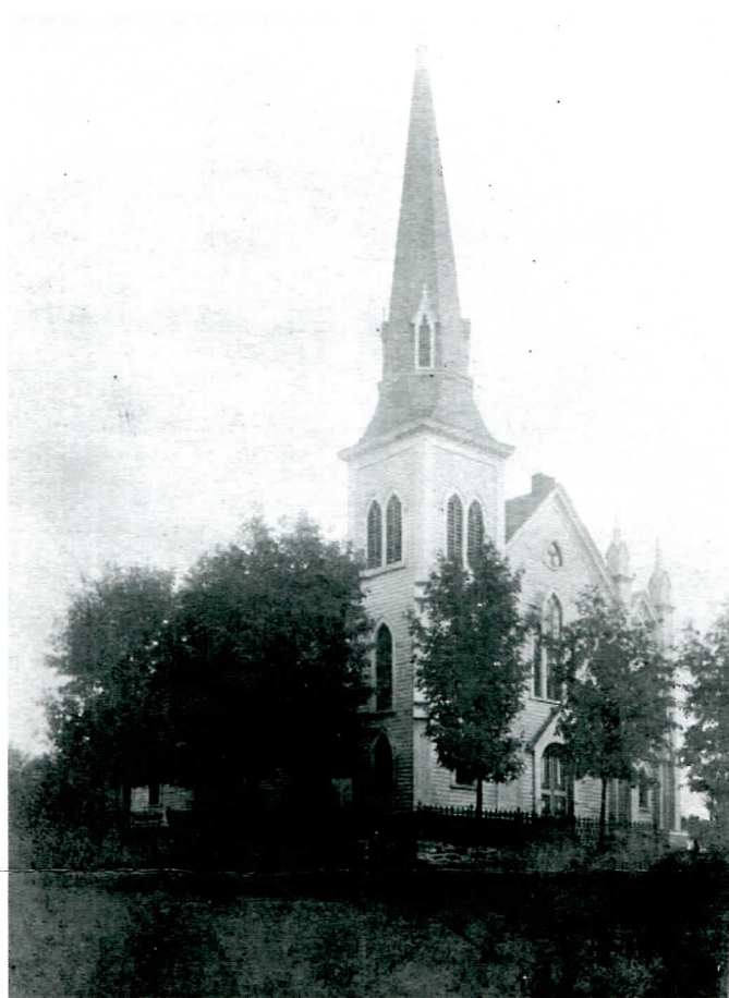
Mt. Airy Presbyterian Church