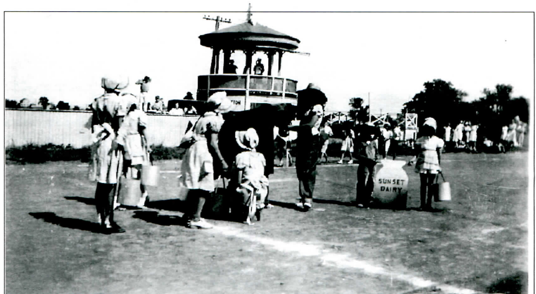
The bandstand/gazebo in 1936

These historical pageants are a fond memory, another closed chapter of County history! But the bandstand/gazebo remains as a reminder of things past.