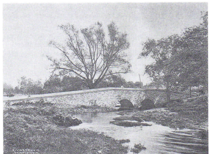
Pictured above is a stone arch bridge near Flemington spanning the Neshanic River, built circa 1834. See above request for assistance in securing information on Hunterdon County stone arch bridges.