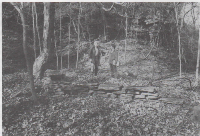
C. The remains of the dam for the Larew oil mill on Nishisakawick Creek can still be seen today.