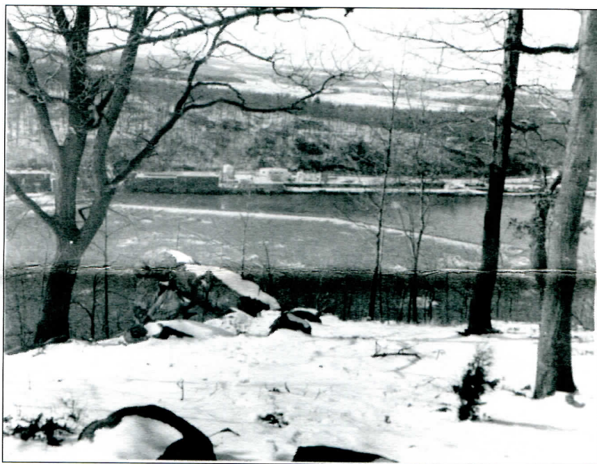
Washington Rock, near Lambertville, on the western edge of Sourland Mountain.