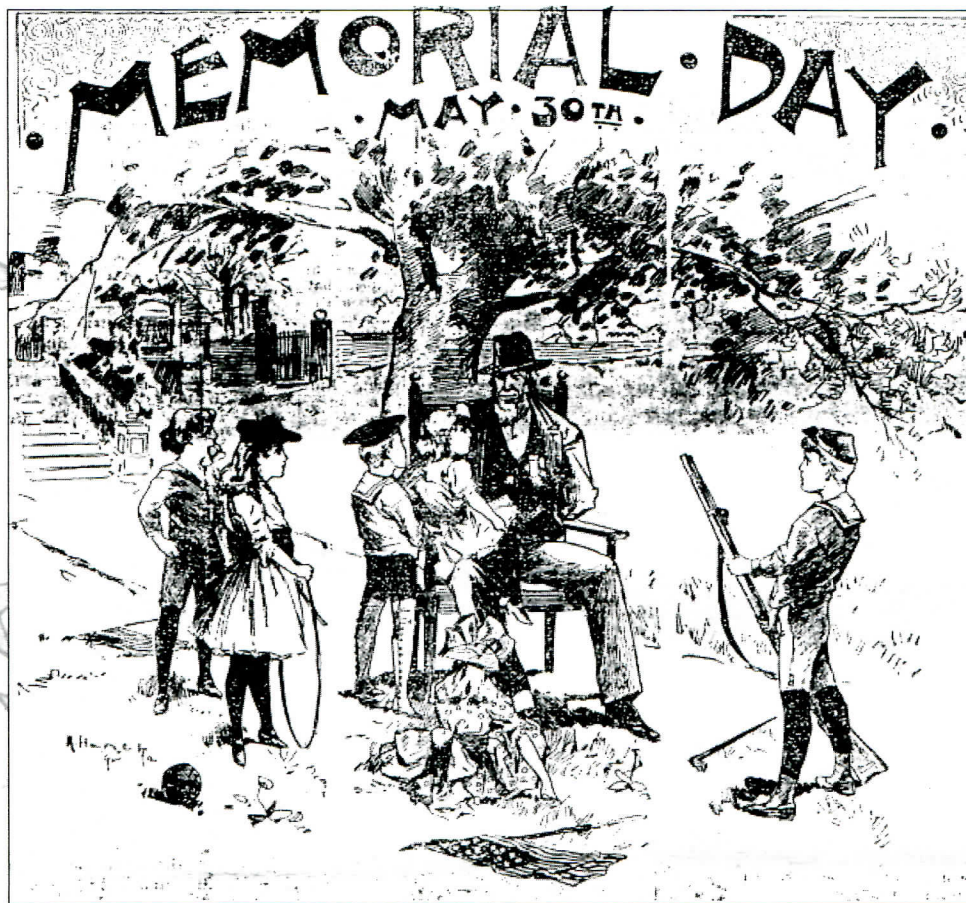
Illustration from The Home Visitor Memorial Day Edition May 30, 1892