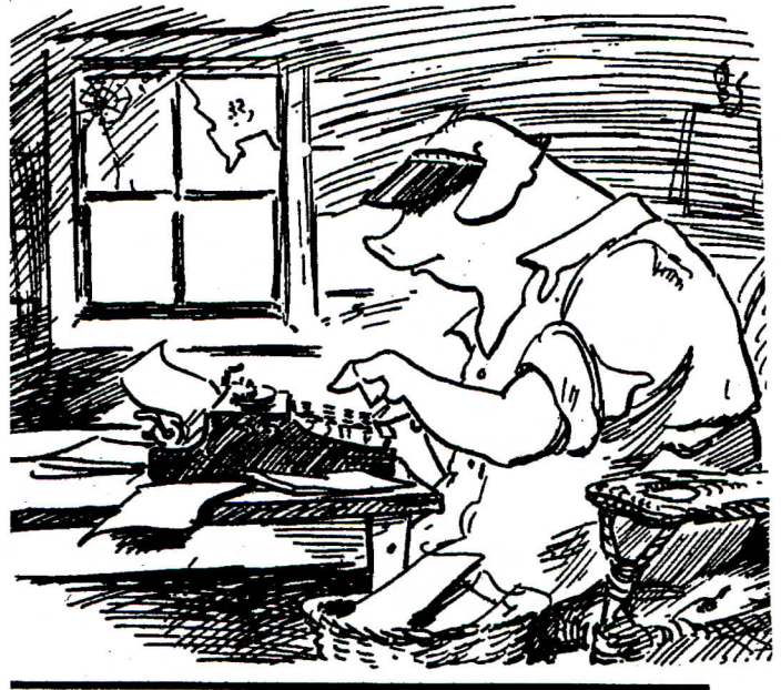
Freddy the Pig