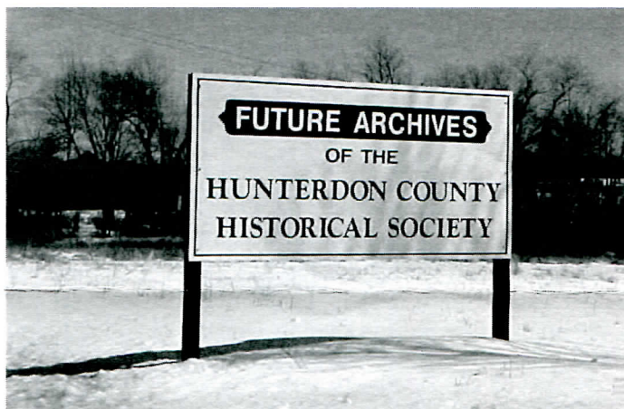
The Archives building site on River Road, Raritan Township, March 2007